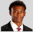
DeVonta Smith - WR