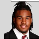
Jalen Waddle - WR