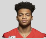
Justin Fields - QB