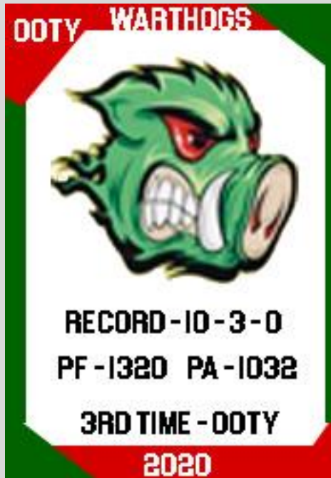
Owner of the Year