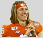
Trevor Lawrence - QB